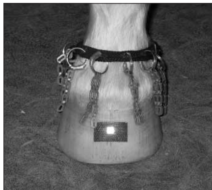
Fig. 1 Tactile stimulator attached to the pastern.

Kinematic data were collected using an automated motion analysis system (Motion Analysis Corporation, Santa Rosa, CA, USA) with eight infra-red cameras arranged at various heights and angulations in two arcs on the left and right sides of the runway. The data collection volume ( 5 \times 3 \times 2 m) was calibrated using a wand technique. The error in a linear measurement of 500 mm within the calibrated volume was < 0.8 mm. Recordings were made under three conditions: